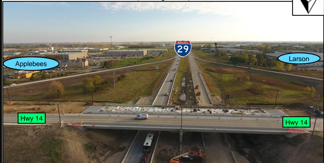
Project Photo: Bridge work @ I-29 bridge. (looking south)